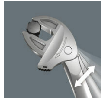
Joker 6004: Ratchet mechanism for fast work

The ratchet function in the mouth sees to fast and consistent screwdriving without removing the tool.