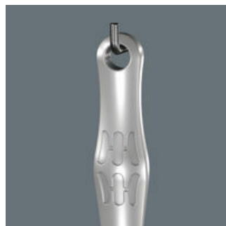
Joker 6004: Useful hole for hanging

Thanks to its hole the Joker can be neatly hung on the workshop wall.