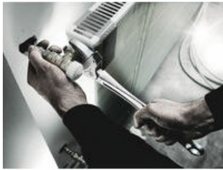
Joker 6004: Automatically and continuously self-setting